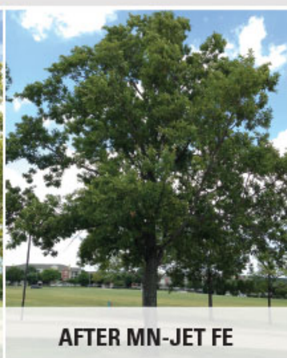
AFTER MN-JET FE