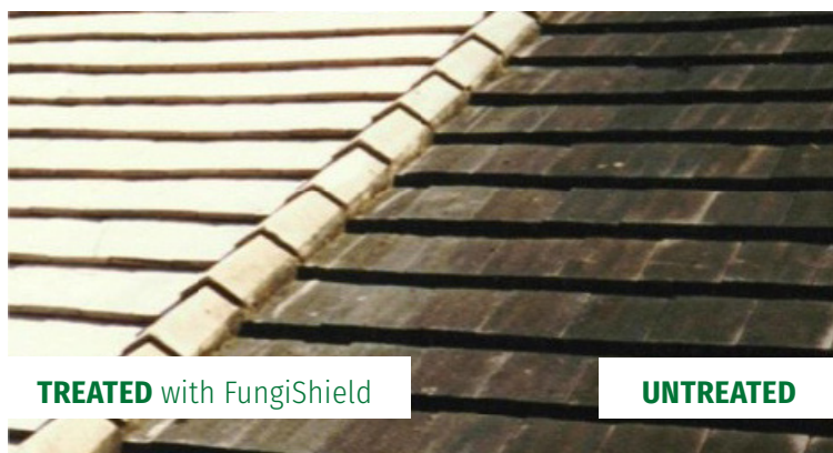
TREATED with FungiShield

Sidewalk after 8 months from initial applicaation