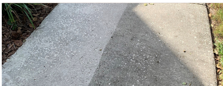
TREATED with FungiShield