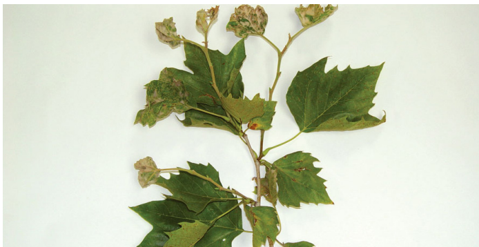
SYCAMORE WITH ANTHRACNOSE

PHOSPHO-jet has shown efficacy in suppressing Beech leaf disease, Phytophthora, black spot, scab, fire blight, anthracnose and more. It's recommended to be proactive and treat with PHOSPHO-jet early in the year, or late in the fall.