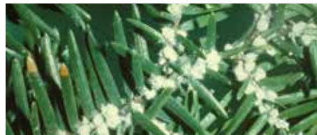
Hemlock Woolly Adelgid