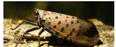
Spotted Lantern Fly