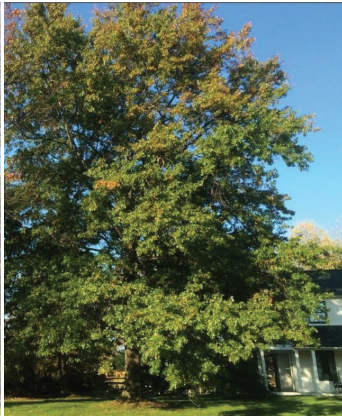
Treated with Arbor-OTC for Bacterial Leaf Scorch