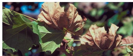
Bacterial Leaf Scorch