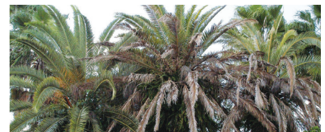
Texas Phoenix Palm Decline