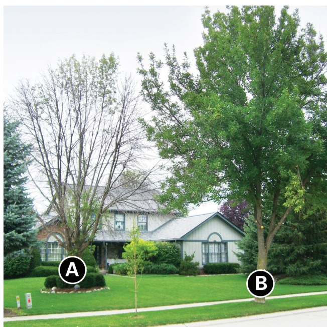
Untreated Ash Tree (A) Compared to an Ash Tree Treated with Arborjet (B)

ARBORJET® Revolutionary Plant Health Solutions