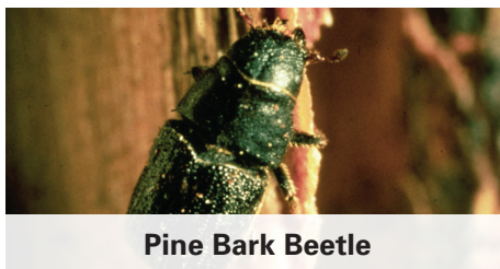
Pine Bark Beetle