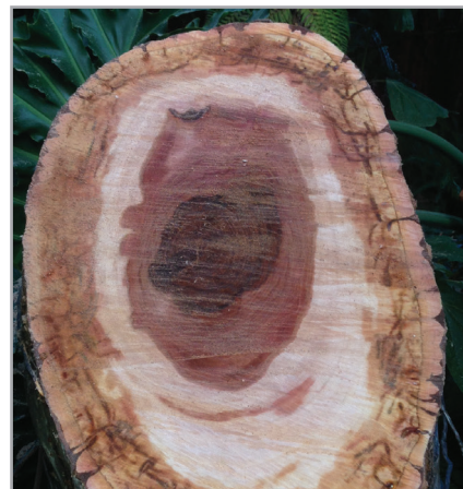
Internal galleries caused by ISHB attack on California sycamore

Preventative treatment with TREE-äge® or TREE-äge® G4 prior to initial ISHB attack is the recommended management strategy. In addition, the systemic application of Propizol® will protect trees from the fungi introduced by the ambrosia beetle. Treatments should be reapplied every 2 years.