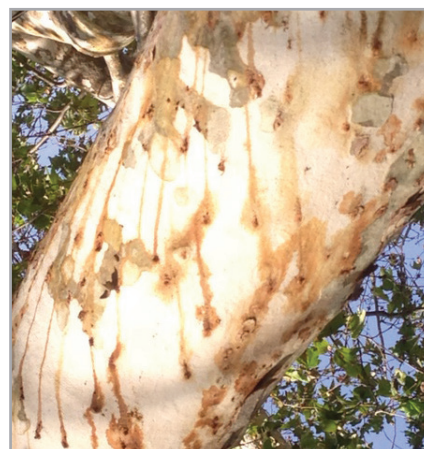
External bark staining caused by ISHB attack on California sycamore