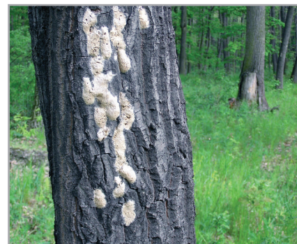
Egg masses on trunk of an oak tree