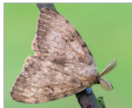
Adult male gypsy moth