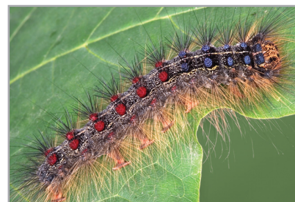
Gypsy moth larva

Trunk injection with any of the TREE-äge® family of products and Mn-jet Fe™ will provide both preventative and curative control depending on the time of year treatment is applied. We recommend treatment in late September, which will minimize early pest damage the following spring.