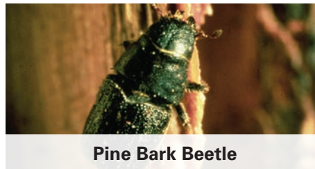
Pine Bark Beetle