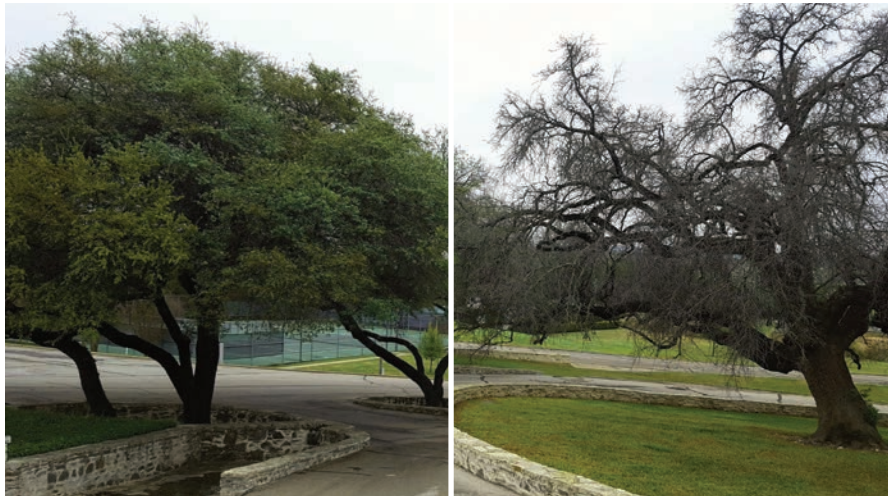
Treated at early stages

Fall injections ensure that the treatment will be in place prior to bud break, slowing the spread of infection and helping the tree to foliate more normally.