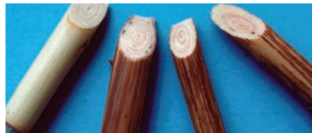
Dutch Elm Disease