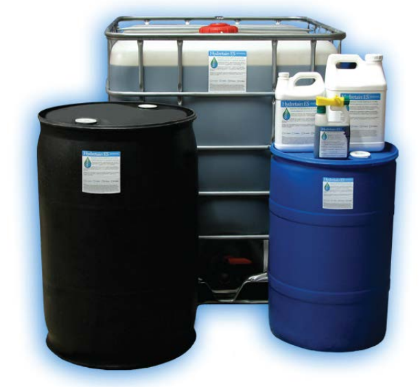
Hydretain is available in an array of package sizes ranging from 1 quart hose-end sprayers to 275 gallon totes.

Caution: If Hydretain is applied to open flowers blooms, rinse with plain water to reduce the possibility of Hydretain pulling moisture from sensitive flower petals.