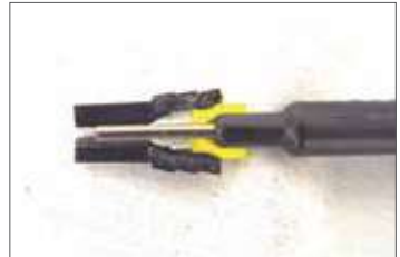
Creates the perfect injection interface; internal septum "seals" injection site.