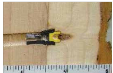
Prevents internal wood decay or infection & speeds site closure & healing.